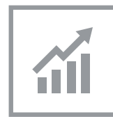
Plant optimization and yield increase