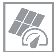
High module conversion efficiency