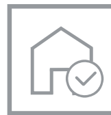
Added aesthetical value for residential